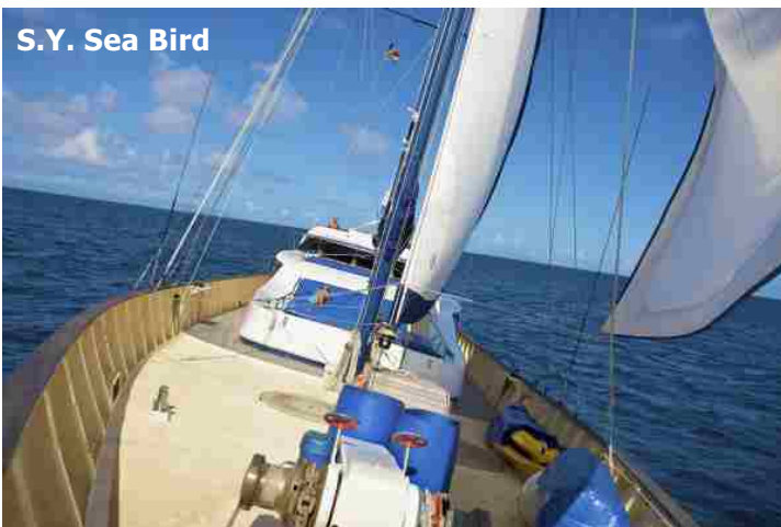
S.Y. Sea Bird