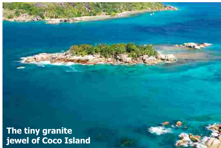
The tiny granite jewel of Coco Island

In the morning the vessel sails toward Grande Soeur and Petite Soeur (the Sisters) for excellent snorkelling and diving, and for a relaxing visit of these unique and completely uninhabited tropical islands. In the afternoon, visit Coco Island, one of Seychelles' tiny granite jewels, a fantastic spot for snorkelling within a kaleidoscope of tropical fish.