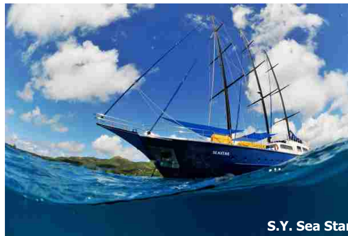
S.Y. Sea Star

Sail to Booby Island for a morning of diving and water sports. After lunch, sail to Aride Island, a globally important nature reserve with more native bird species than any other island, including five endemics and the world's largest population of 3 species (Lesser Noddy, Audubon's Shearwater and Seychelles Warbler). The nature trail leads to a spectacular cliff-top view with the largest frigatebird roost outside of Aldabra. Aride is the only natural location in the world for Wright's Gardenia and 400 species of fish have been recorded around the island.